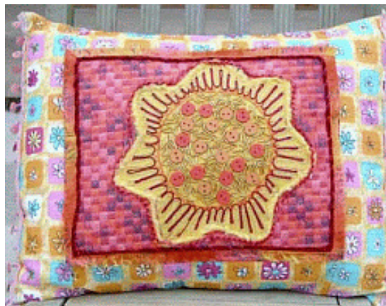
Beaded Flower Pillow Designed by: Treasure It Skill Level: Intermediate

A Great free project is available from Kreinik at www.kreinik.com . Look for the Beaded Flower Pillow Project under the Freebies link.